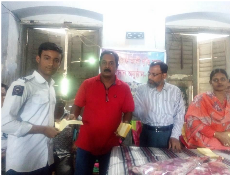
Scholarship money is given out to the selected students.